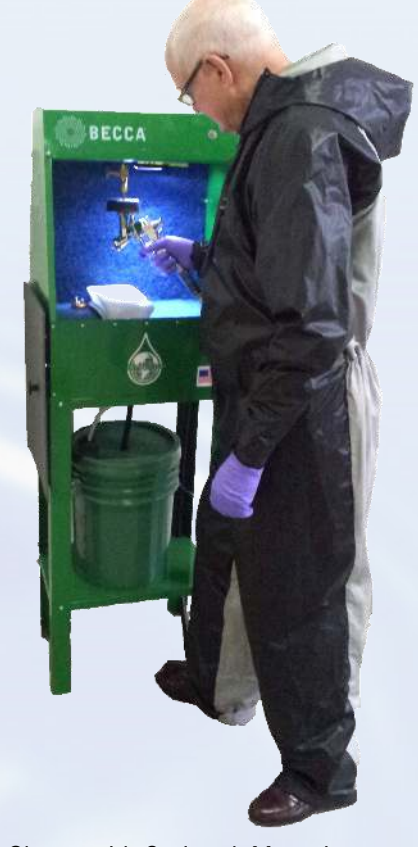
Shown with Optional Mounting Stand with Legs Kit