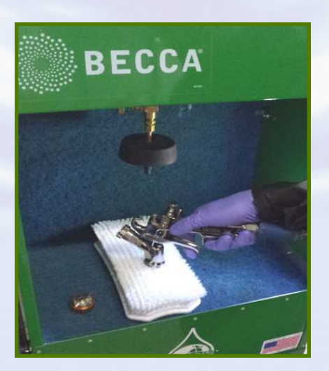
Air Cap Scrub BRUSH ..... Stiff Nylon Bristles for Quick Cleaning